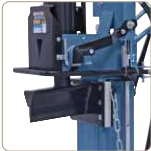
Large splitting wedge features solid, durable plastic guide.