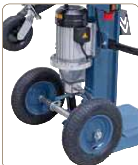
Large rubber wheels allow for easy transport (HS 16 E).