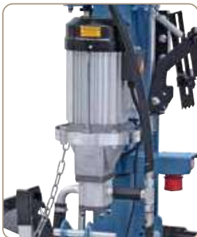
ZE-models with powerful electro motor and high quality hydraulic pump.