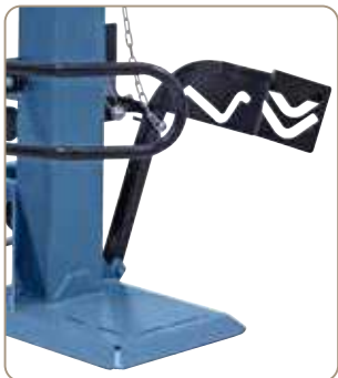
For raising of heavy logs complete with mechanic log lifter.