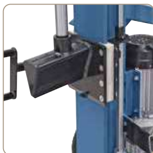
Large splitting wedge features solid, durable plastic guide.