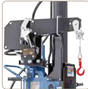
Optional available: Hydraulic winch