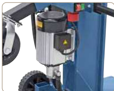
Powerful electro motor and high quality hydraulic pump.