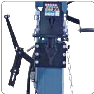
Two-handed safety operation for safe work, forward speed alternatively fast or slow.