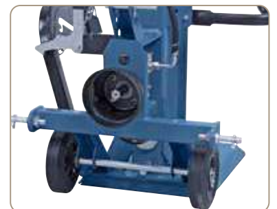
Serially with three-point attachment according to cat I/II and pins