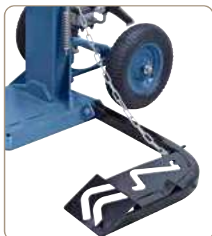
For raising of heavy logs complete with mechanic log lifter.